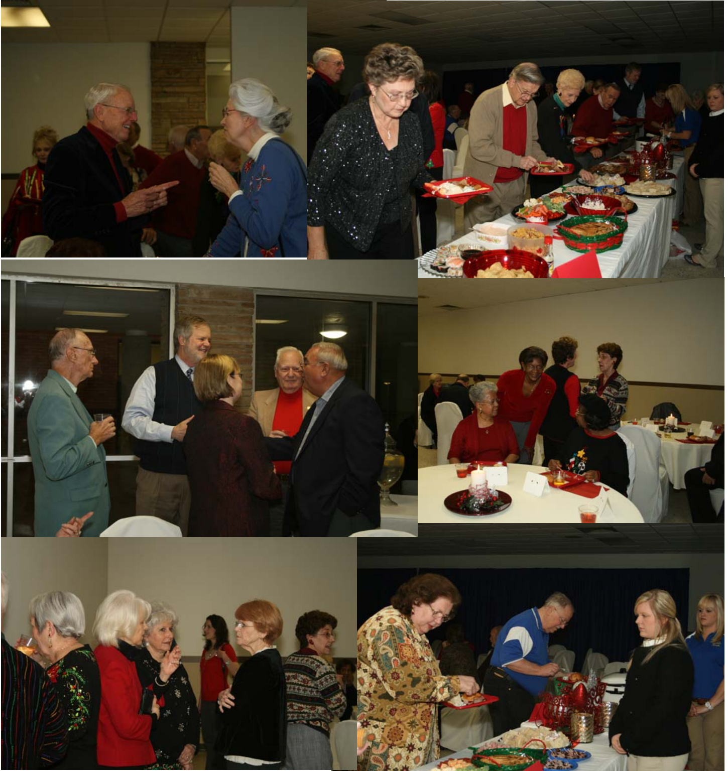
Photos from 2010 Christmas Party