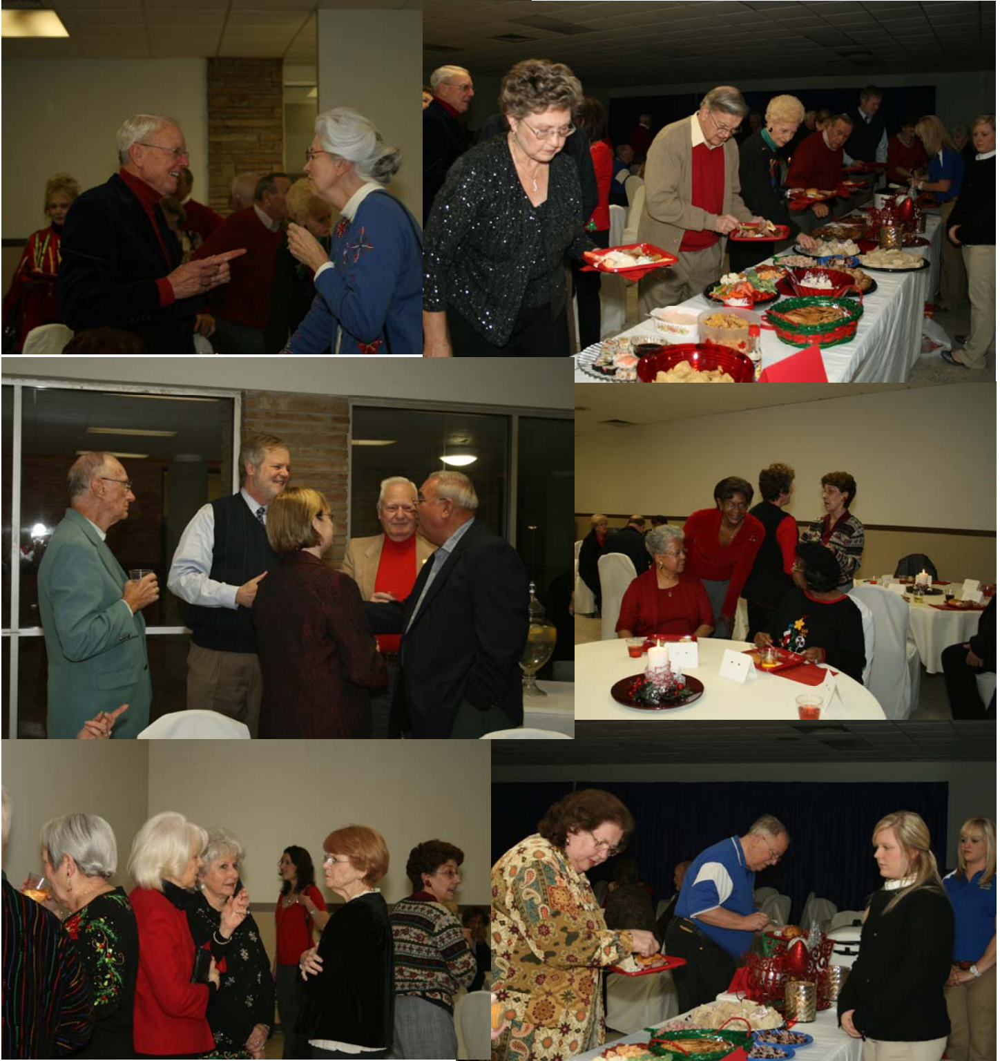
Photos from 2010 Christmas Party